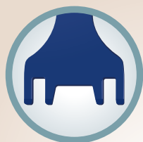
Wide model: for VW, SEAT, Skoda, Audi