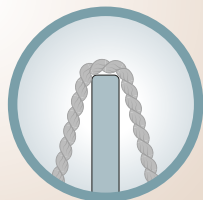
Smart cord prevents the tool from falling into the door.