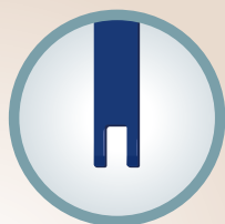
Narrow model: for BMW, Mercedes, Ford and more