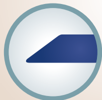
Beveled teeth open the clamps effortlessly.